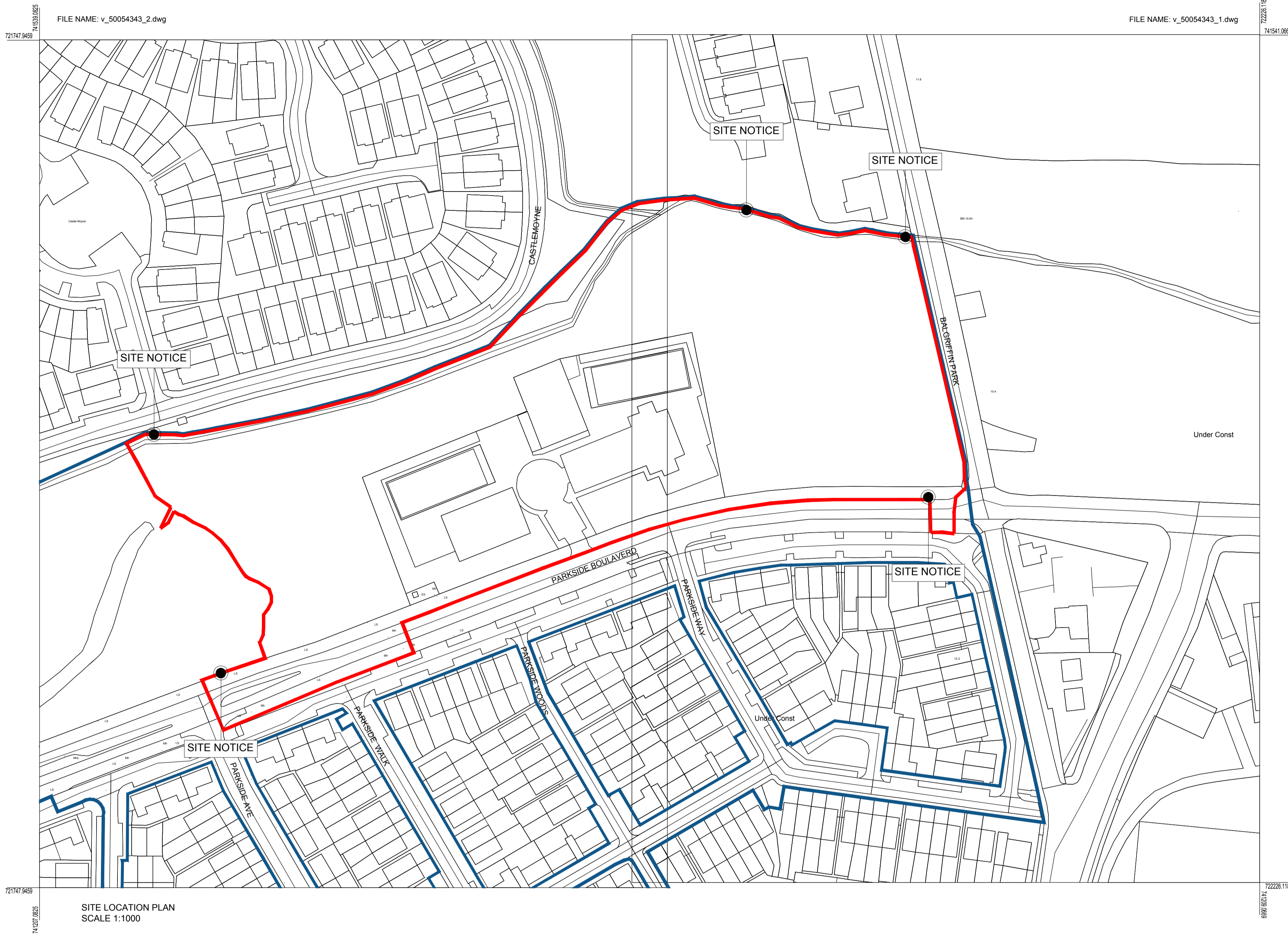
SITE LOCATION PLAN SCALE 1:1000